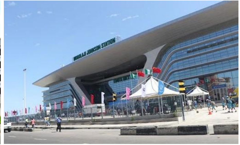
MOBOLAJI JOHNSON STATION, EBUTE METTA