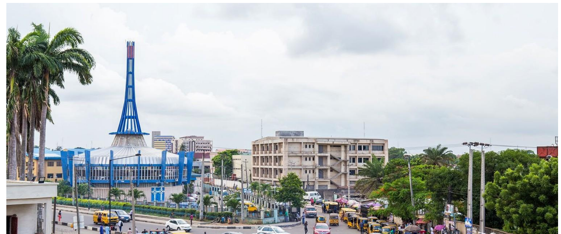
OZONE CINEMAS, EBUTE METTA