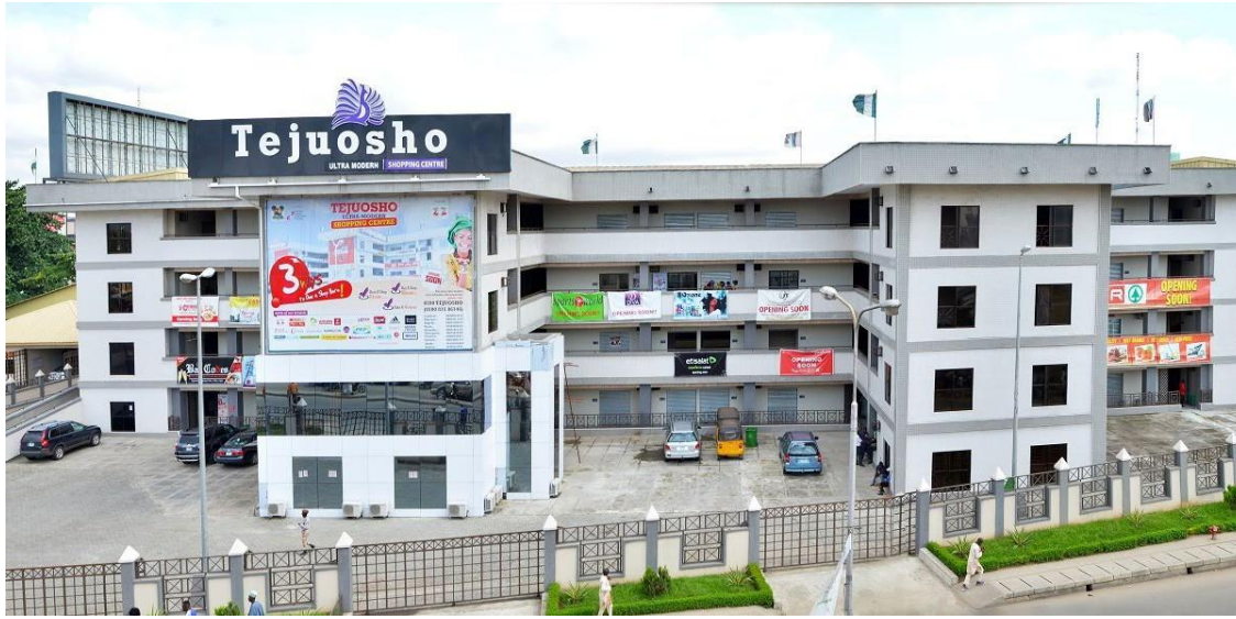
TEJUOSHO MARKET, YABA